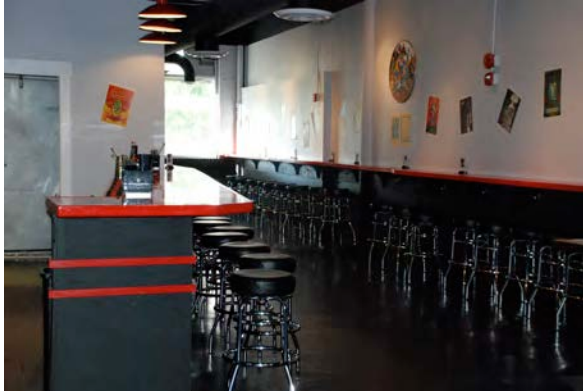
The Vinyl Lounge

The room is designed with tiered seating platforms to improve sight lines and has had acoustic treatments to ensure great sound. Consulting on the audio equipment are two of the area's best: Greg Lukens of Washington Pro Sound and Tim Kidwell of the Birchmere. The music room boasts a 300 square foot stage, and has a capacity of approximately 300, depending on the evening's entertainment.