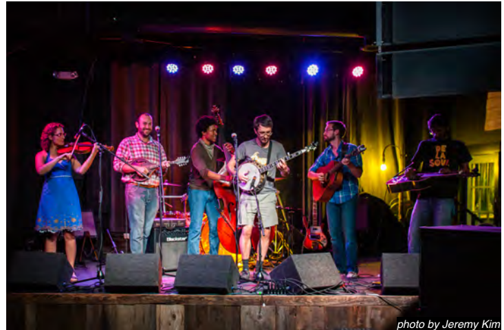
The Delafield String Band

Headliners typically will take the stage on the early side, offering an option for city workers who want to stay downtown and catch dinner before the show. And rather than closing up after the main show, Gypsy Sally's will offer its later stage to different local or regional artists.